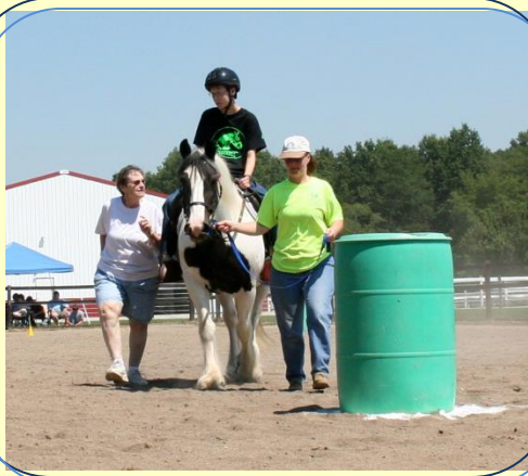
Rider & Two Volunteers from our 2011 Fun Show